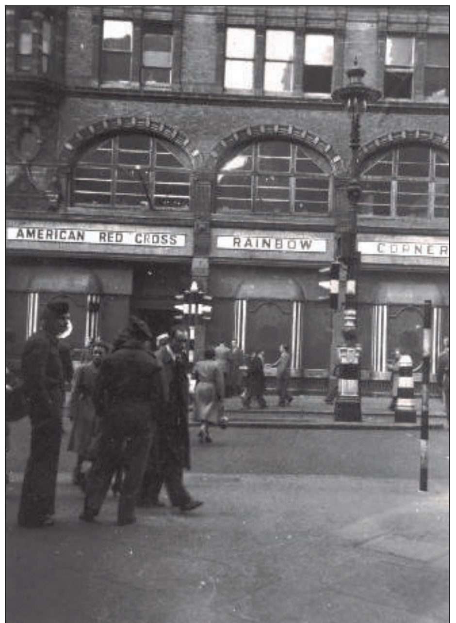
The Rainbow Corner Red Cross Club was a must stop for every GI coming to London on pass. Does anyone have memories of their visits to the Rainbow Corner? Send us some stories. We promise we won't tell your wives.