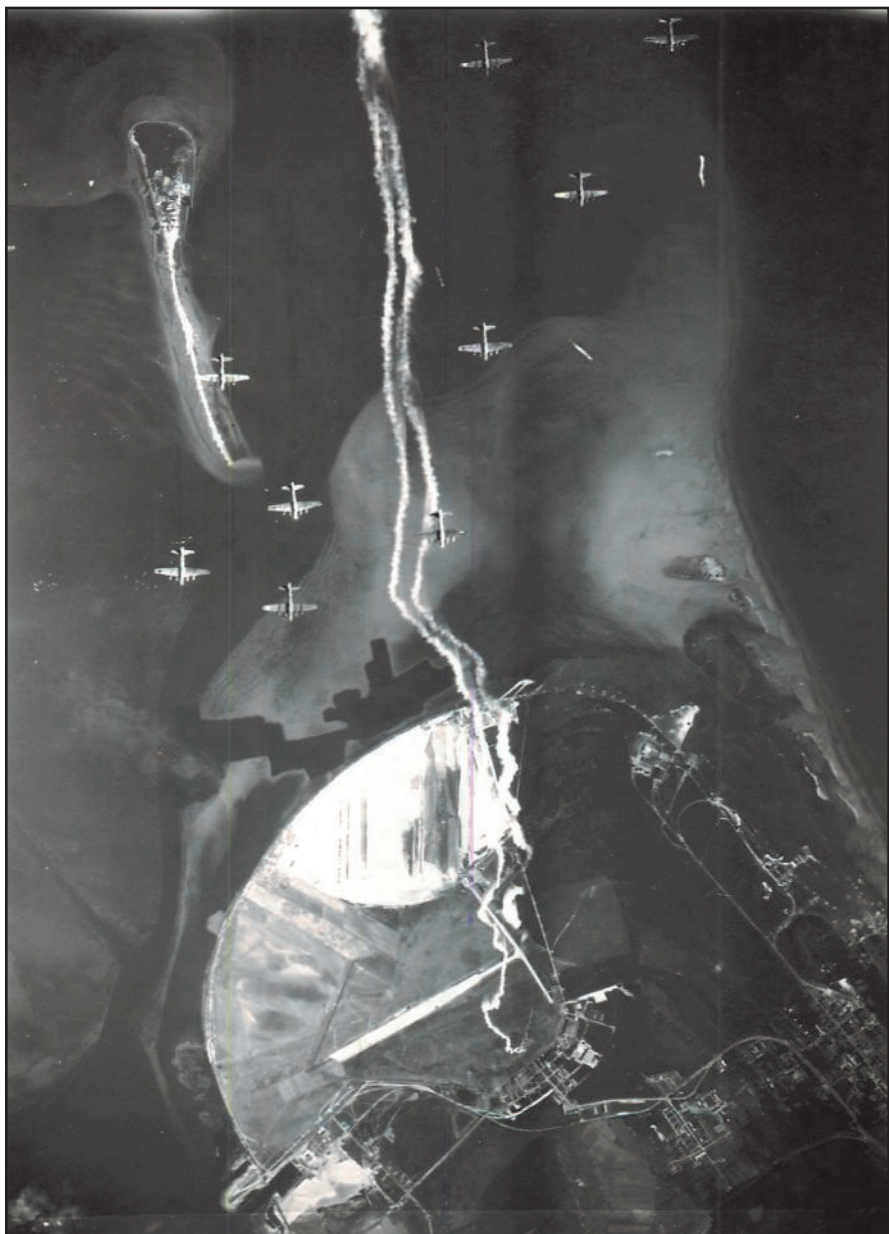
The 306th Bomb Group makes its approach to target at Peenemünde on 18 July 1944. This photograph tells the story as the camera records the bombing run while fires burn below. Peenemünde, a frequent target for the Eighth Air Force, was the site of the German heavy water operations.