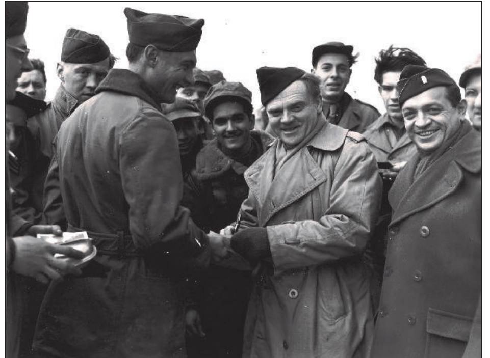
Jimmy Cagney visits Thurleigh during the war. Cagney was a frequent visitor on USO tours and visits throughout the Eighth Air Force in England. His commitment to the military raised the morale of many as his shows brought a little bit of home to “merry olde England.”

PS: Expect a mailing that will include a brochure that solicits participation and proposes the idea of a “return of the heroes” trip to Thurleigh U.K airfield. Such a trip will be planned if there is interest among veterans, even if they rarely if ever attended prior annual meetings/reunions. In addition, if there is interest among those who cannot afford such a trip, we will attempt to raise funds to help them go.